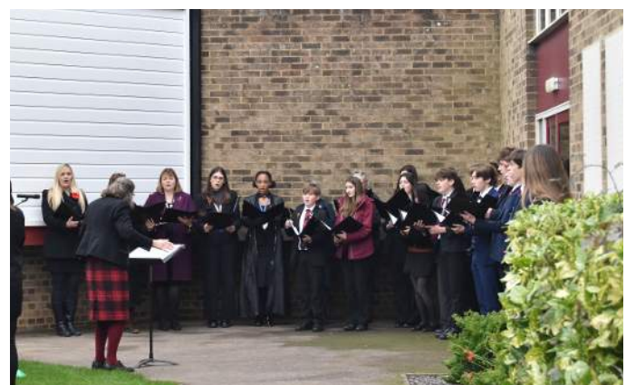
The Chamber Choir