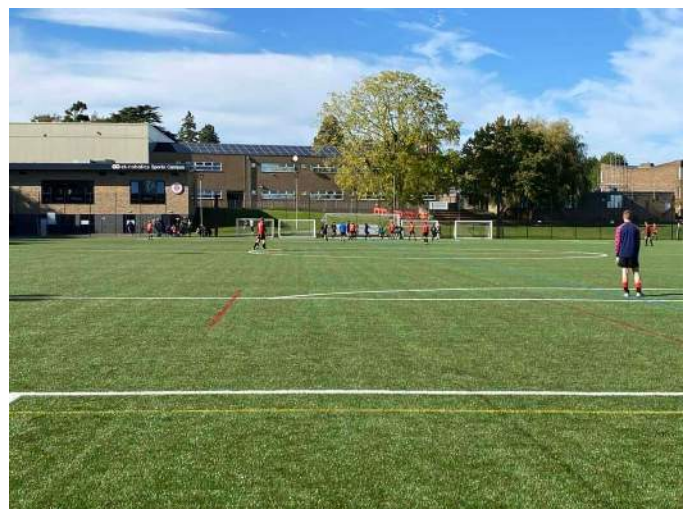
The 3G Pitch in action

The facilities are incredible, especially compared to what they were like in 'my day'. The 3G pitch is a game changer and the standard of football that the boys and girls play now is far superior to the quality of football played on those muddy grass pitches that I can remember 15-20 years ago!