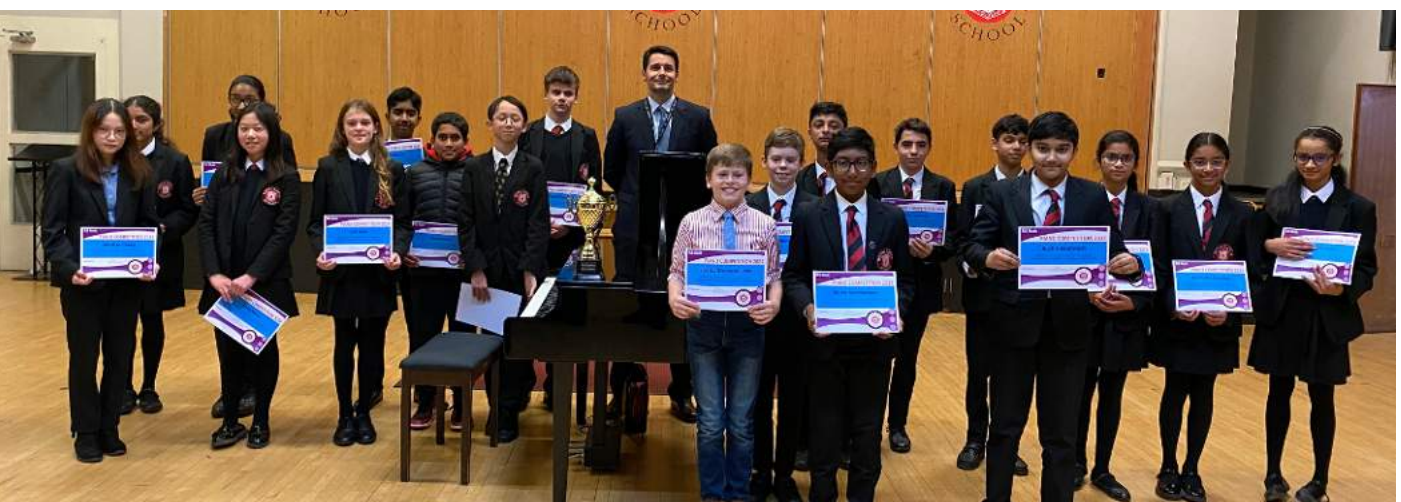
The 19 student finalists of the RLS Piano Competition 2024