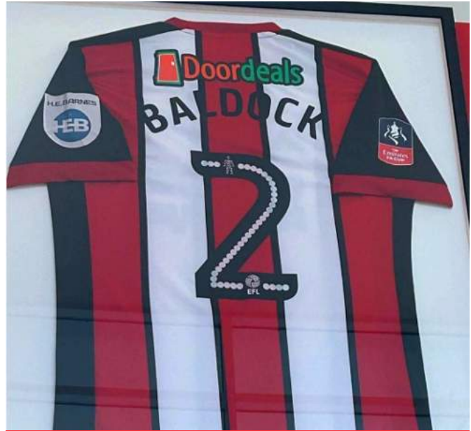
George kindly donated one of his Sheffield United shirts, which is proudly displayed in school