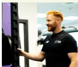
Interview with an Old Latin member of staff