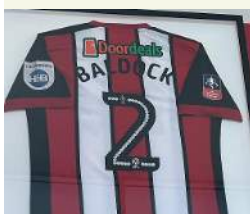
Remembering Old Latins