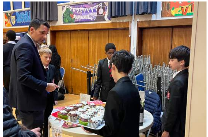
Year 8 Christmas Fair