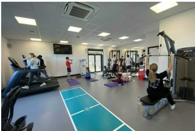
Students exercising in the VIVA Gym

The students absolutely love the new sports facilities. The opportunity that the new facilities have provided our students is enormous and I can think of countless students who have benefited in terms of their physical development, but also grown in confidence too.