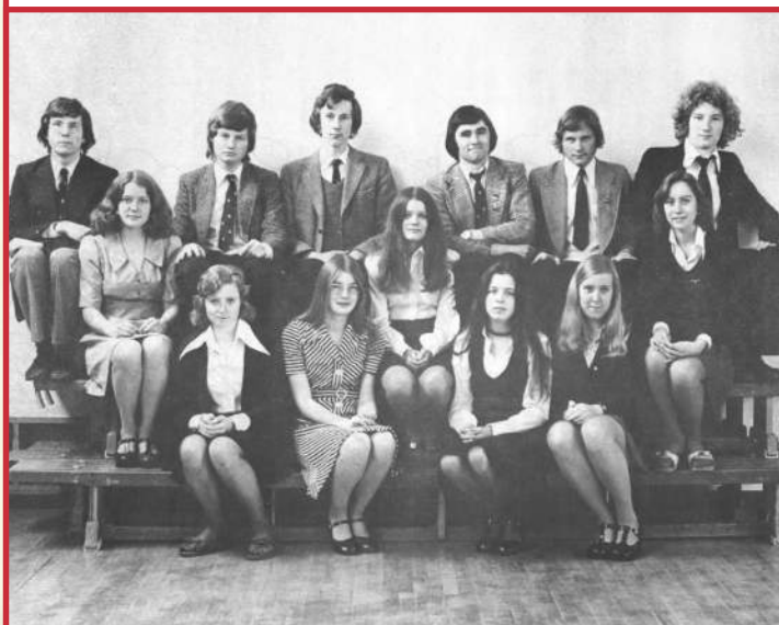
A photo of the 1974-75 prefects from the 1975 school magazine.

Want to see more memories from 1975? Check out the SDS Archive from the menu on RLS Connect. If you search "1975" you should find the 1975 school magazine, complete with photos, news, art, and creative writing from that year.