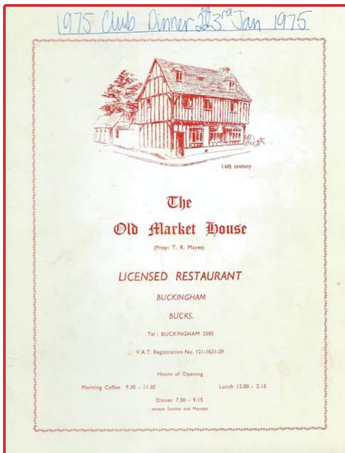
The menu from the very first '75 Club reunion in Buckingham

Calling the Class of 1975 - 50th Reunion - 14th June 2025