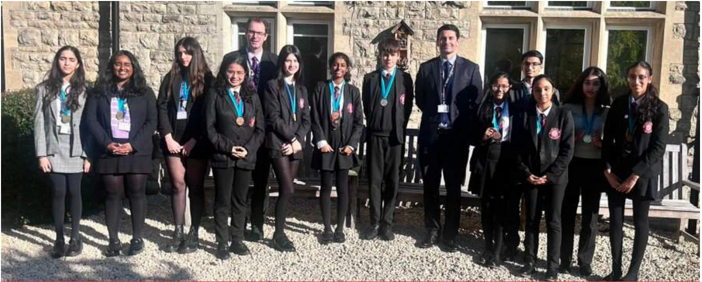
Youth STEMM Award - students across year groups have achieved Bronze, Silver and Gold awards through extracurricular activities in science, technology, engineering, maths, and medicine