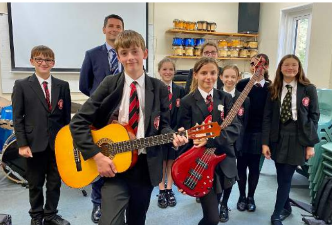
Students from across the school participated in the first lunchtime concert of the year in September