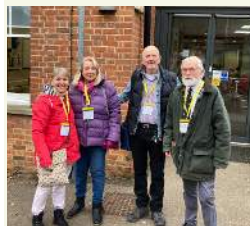
Old Latins back in school